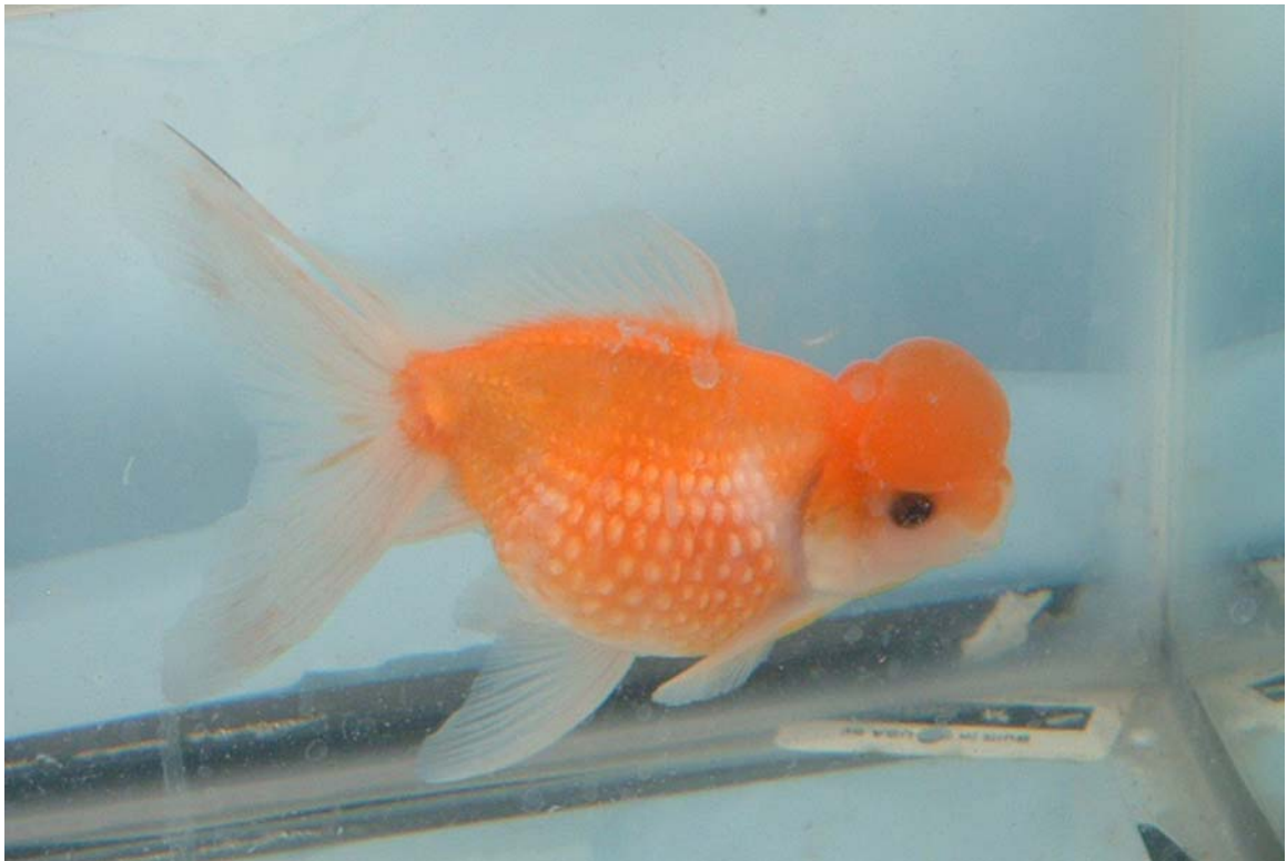
Hamanishiki from Spokane 2006 Show