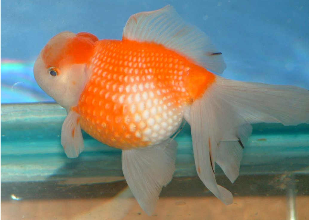
Hamanishiki goldfish from the 2006 Portland goldfish show