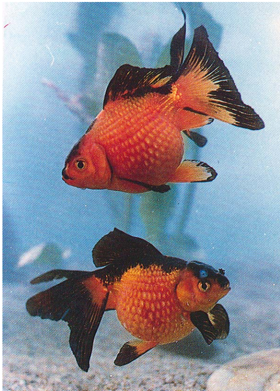
Red & Black Pearlscales from Chinese Goldfish