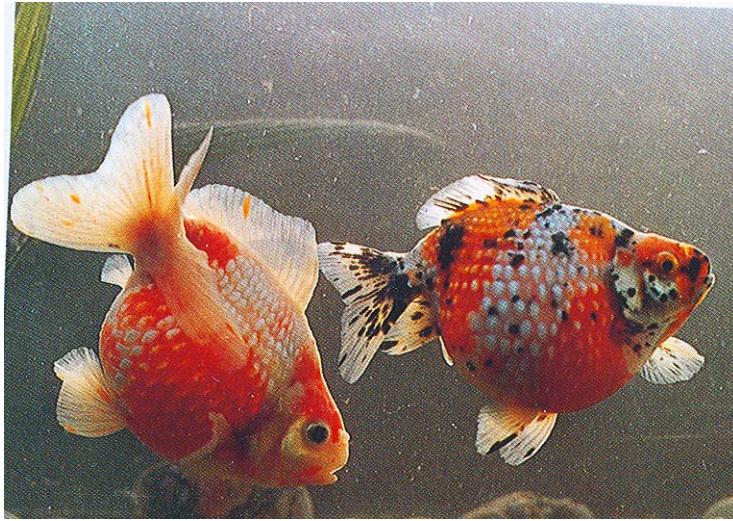
Calico Pearlscale from Chinese Goldfish